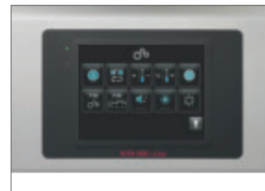
Very user-friendly basic, service and control programs

1. User-friendly: the touch display and intuitive menu navigation make working with the VITA V60 i-Line very easy. The minimalist design and robust technology focus on one central function: reliable firing.