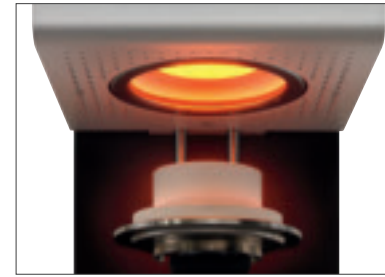
Excellent firing results